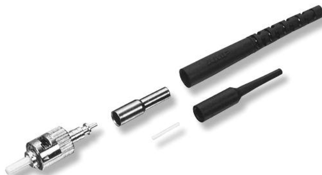
LightCrimp Plus ST

and is currently listed under the TE part number (2064757-1) . In addition, it is listed under the CID number A-A-59917. This approval is the latest in this series and joins the approved status of the LC and SC tight construction epoxy optic connectors listed on the components parts list.